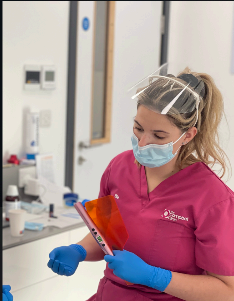
TCC INTERACTIVE EVENING 6TH FEBRUARY

Meet our fantastic speakers for our 2025 Peer Review events!